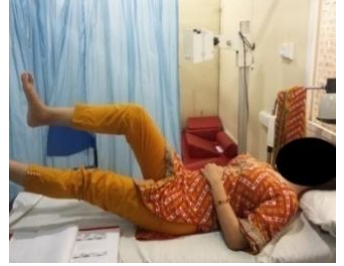
Figure 5: Level 4