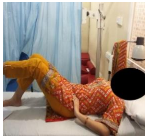
Figure 4: Figure showing level 3