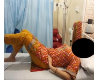
Figure 3 Level 2 TrA